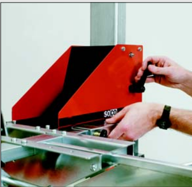
Easy and quick height adjustment