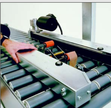
Efficient side drives