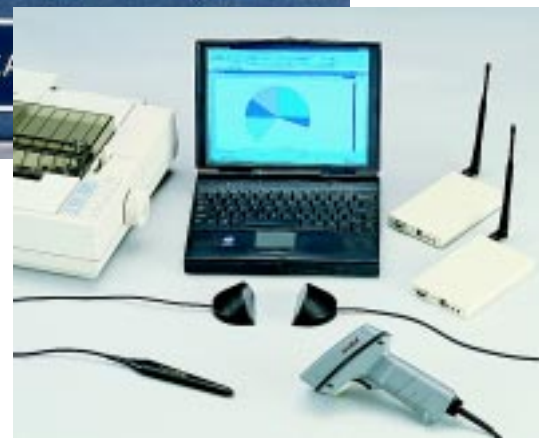
Optional data collection equipment

With an optional bar code wand and an infrared transmitter receiver, you can automate data collection. Scan bar codes to simplify the entry of pro numbers or employee ID. SimulCast can even document results of periodic weight accuracy tests. After you have stored a day’s worth of scale data and estimated information from the customer weight ticket, you can download information to a PC or printer via an infrared transceiver, RF