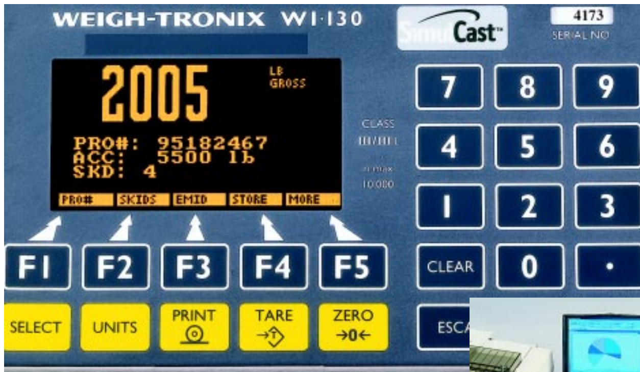
The SimulCast WI-130 Indicator simultaneously displays readings of weight, pro number, accumulated weight and accumulated number of skids.